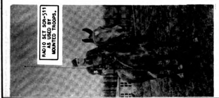
RADIO SET SCR-511 AS USED BY MOUNTED TROOPS.